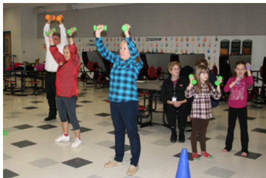
Participants use hand weights during the December meeting of the Holley's Biggest Winner Weight Reduction Contest